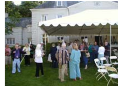
Chamber members and friends gather at the Chamber's After Hours at Bloedel Reserve