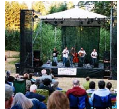
Farmstock concertgoers enjoy the Dan Tyminski Band