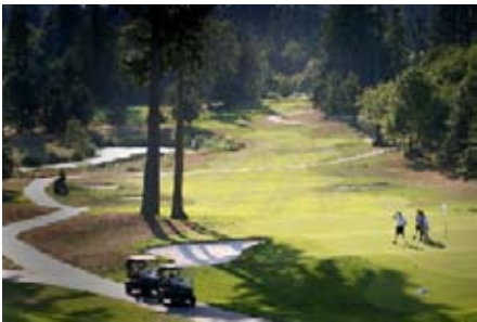
It was a lovely day at beautiful Wing Point