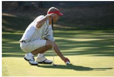
Golfer lines up a putt