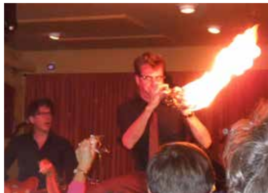
Guests danced the night away with the Dusty 45s at the Treehouse Cafe. The lucky couple who won the grand prize was spirited away in a limousine at 12:45 AM.